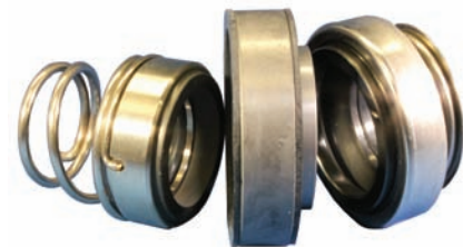
VGFS-1006 With Common Seat